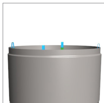
BinSystem 4200 C with lifting loops