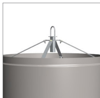
BinSystem 4200 C-Q with quick system