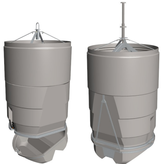
1. Single bottom with quick system

Molok®-Deep Collection System complies with the requirements of EN13071-standard.